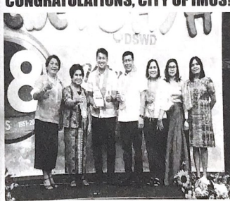
Based on Paglilingkod sa Sambayanan (GAPAS) Award for being a Model LUGU in the implementation of Pantawid Pamilyang Pilipino Program (4Ps) awarded by the Department of Social Welfare and Development Field Office (VA) during the Panata Awards 2018 as part of the 68th Year Anniversary Celebration of DSWD.