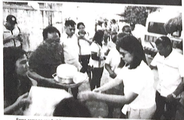
Sama-sama po ang iba't ibang sangay ng ating pamahalaang lungsod sa pagbigay tulong sa mga Bacoorenyong naapektuhan ng sunog sa Tabing Dagat.